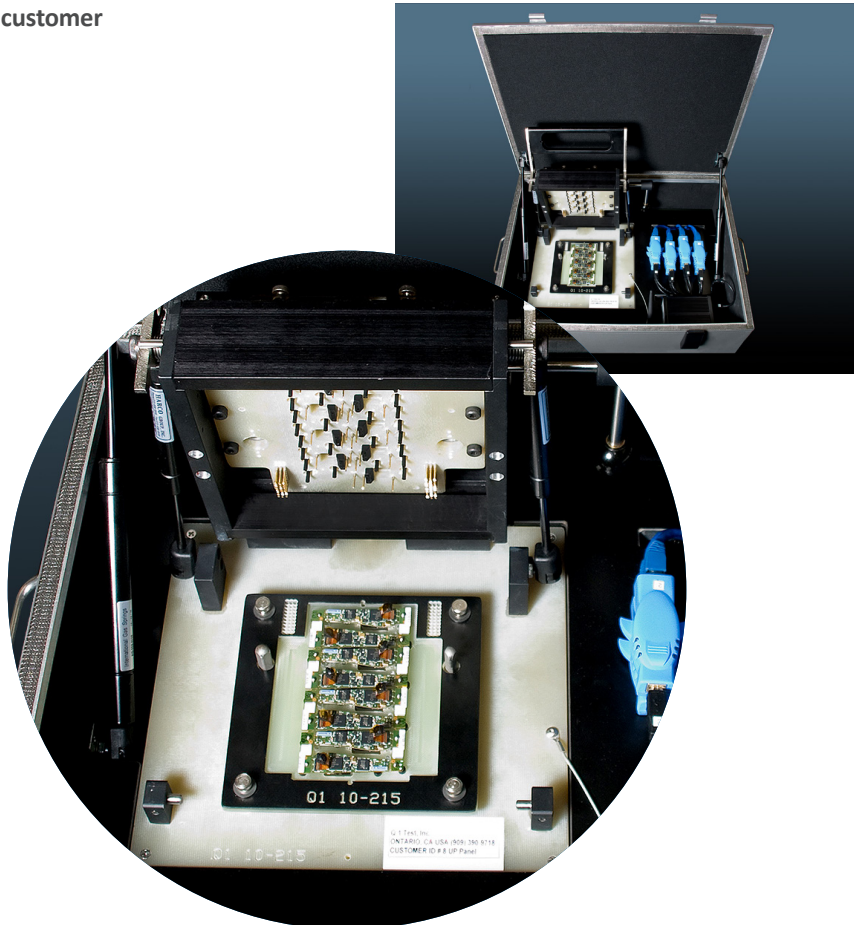
Bed of nails test fixture