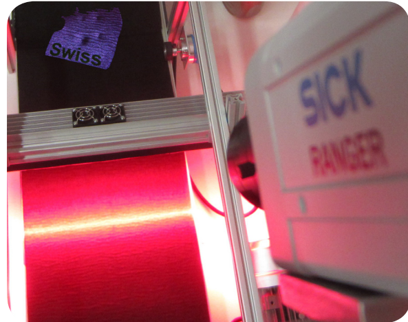
3D imaging setup