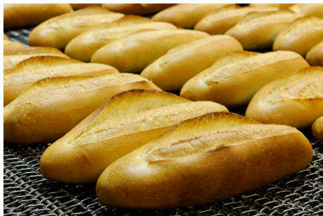
NeuralVision can learn to recognize good and bad products just as we do.